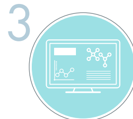
Analysis of results