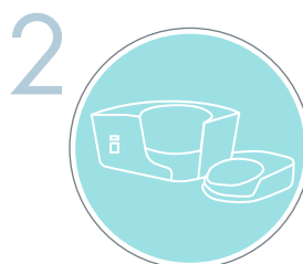
Processing in ddPCR*